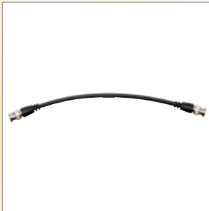
OALC 025 ASI cable 250 mm BNC - BNC