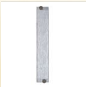
OCP 0220 Cover plate 20 mm