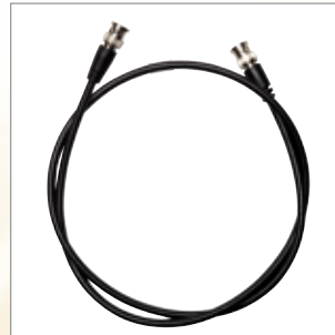
OALC 100 ASI cable 1000 mm BNC - BNC