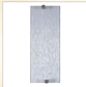
OCP 0250 Cover plate 50 mm

Technical Modifications reserved. WISI cannot be held liable for any printing error. 084 260/02.10